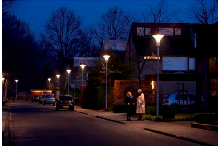
Figure 6: New LED lighting in Tilburg