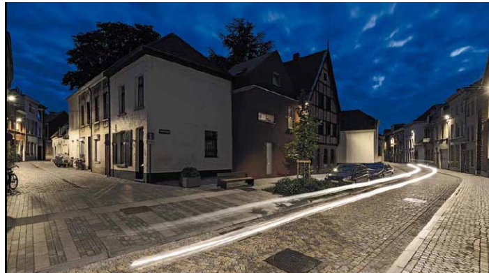
Figure 5: Mechelen's street lighting

The city of Mechelen has over 10,000 street lights installed with a total electricity consumption of more than 4.4 million kWh per year. In the city centre, traditional street lighting has been replaced in stages between April and June 2012 by 577 innovative high-quality LED lighting units spread over 90 streets. LED lighting has brought great improvements in safety, the environment and the general ambience. The new lighting units result in expected energy savings of 37% and have much longer lifetimes (approximately 60,000 hours). The installed system is future-proof and can easily be upgraded to keep pace with the rapid evolution of LED technology, which will permit additional energy savings. The project was implemented by the Flemish regional electricity distribution network operator Eandis.