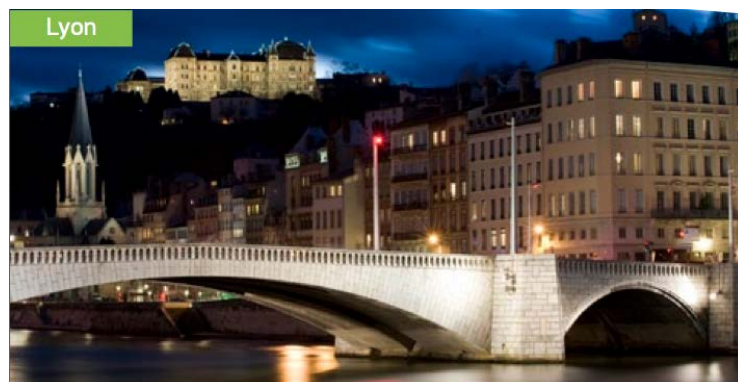
Figure 4: Lyon city centre 24