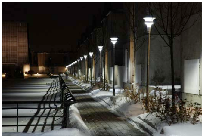
Figure 7: Albertslund street lighting

The municipality of Albertslund, located in the wider Copenhagen area, has adopted a new lighting plan which is solely based on LED technology. The plan includes the development and testing of different street lighting designs and Wi-Fi based smart control systems. In recent years, the town has contributed to the invention of several outdoor lamps, in close cooperation with designers and manufacturers; noteworthy is the award winning "A-lamp". Today, the first stage of a "Scandinavian Lighting and Photonics Science Park" is under development in Albertslund, with the 'Danish Outdoor Lighting Lab' (DOLL) as the driving force. Copenhagen, the European Green Capital 2014, will invest € 40 million to replace 21,000 street and traffic lights with SSL by 2015.