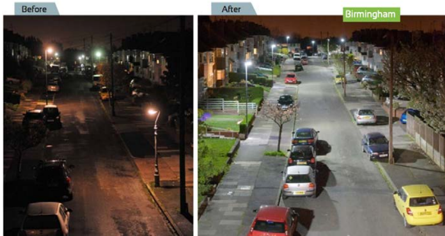
Figure 1: The impact of LED deployment in Birmingham