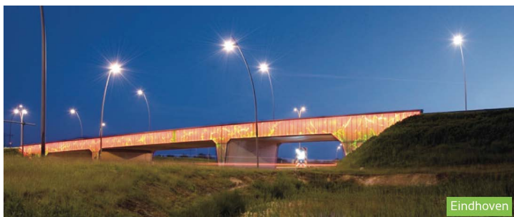
Figure 2: Bridge Lighting in Eindhoven 22

An innovative deployment of SSL in Eindhoven is the use of colour to provide safety information and to reduce environmental impact. Coloured lights have been installed in the pavements as auxiliary safety indicators to better highlight pedestrian and cyclist crossings in the city, and low intensity green lighting has been deployed on rural cycle paths to improve visibility and minimise impact on the local fauna.