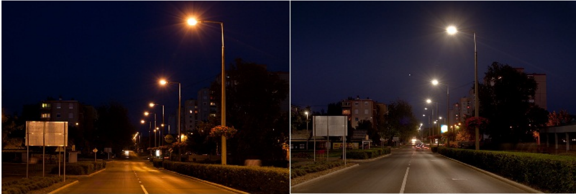
Figure 3: Kaszap Road, replacement of HPS by LED

In 2010 and 2011 more than 6,000 new LED street lighting luminaires were installed in the city of Hódmezővásárhely. The energy savings achieved are 35% and the new lighting solution is nearly maintenance free. Through the new SSL solution the lighting levels and the overall visual comfort and feeling of safety have been significantly increased.